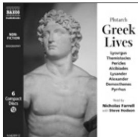
Greek Lives (Plutarch) ISBN: 9789626342893 read by Nicholas Farrell