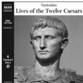
Lives of the Twelve Caesars (Suetonius) ISBN: 9789626343395 read by Derek Jacobi