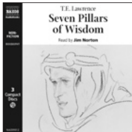
Seven Pillars of Wisdom (Lawrence) ISBN: 9789626340103 read by Jim Norton