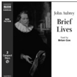
Brief Lives (Aubrey) ISBN: 9789626343784 read by Brian Cox