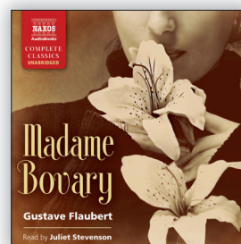
Gustave Flaubert Madame Bovary Read by Juliet Stevenson